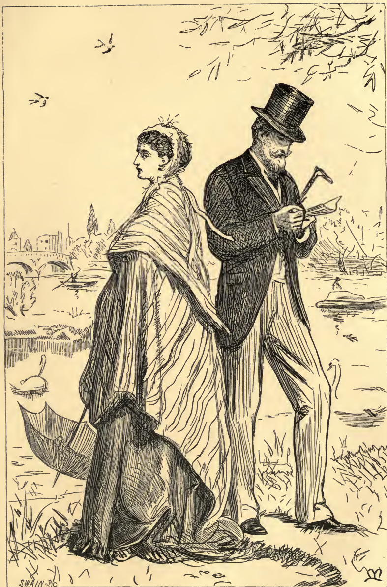
Phineas had no alternative but to read the letter.